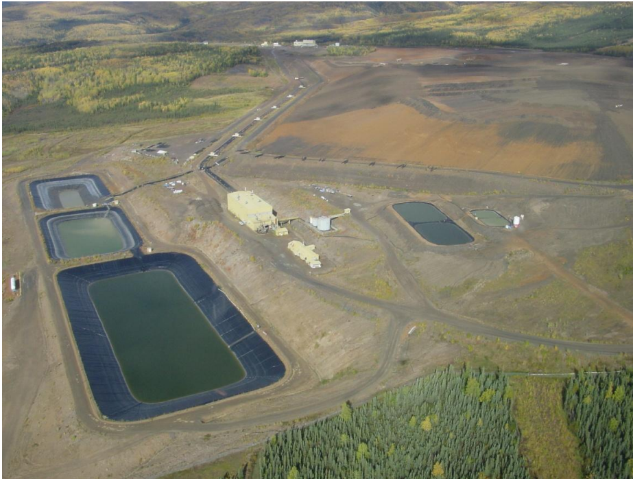
Previous mine workings at Brewery Creek